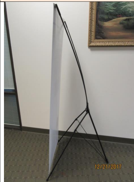
Side View of X-Banner